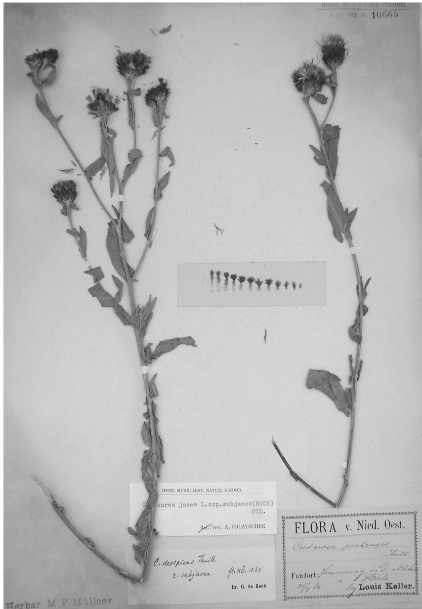
Fig. 2. The lectotype of C. decipiens f. subjacea BECK (W 1912-10665).