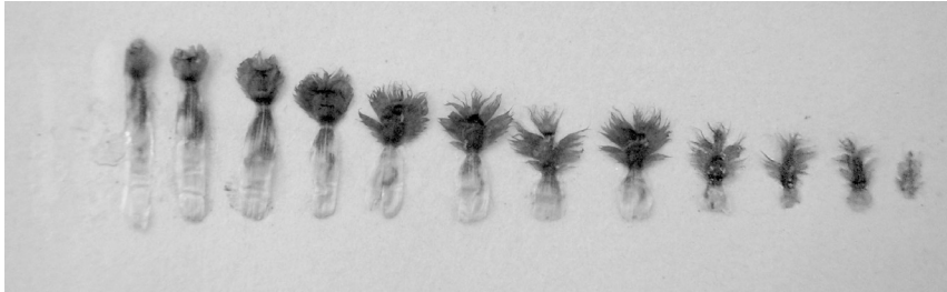
Fig. 3. Detail of the plate with involucre bracts from the lectotype of C. decipiens f. subjacea BECK (W 1912–10665).

All three cited sheets bear similar plants that are hybrids with certainty, for they have the typical irregular shape of appendages of involucre bracts (Fig. 3). One parent is C. jacea , the other is with highest