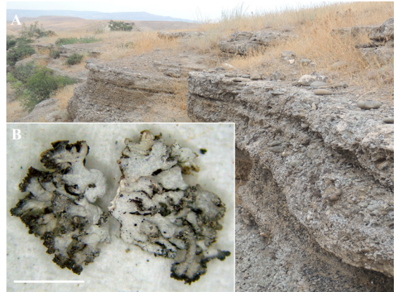
Fig. 2. Anaptychia elbursiana . A – habitat; B – thallus (scale bar 0.5 cm).

Thallus foliose, 3–4 cm in diam., appressed, white to gray, usually pruinose, sorediate. Lobes mostly irregularly flabellate, contiguous to overlapping, 0.8–1(2) mm wide, flat at the tips but becoming convex towards the lobe bases, with rather coarse, but sparse cortical hairs near the lobe ends. Soralia primarily marginal and terminal on lateral lobes, labriform, sometimes with scattered punctiform laminal soralia forming in older thallus regions; soredia coarsely granular, often becoming distinctly darkened, sometimes almost black. Upper cortex prosoplectenchymatous. Medulla white. Lower surface almost white on the lobe ends, becoming pale to dark tan towards the lobe bases, without well-developed cortex; rhizines scattered, simple to irregularly