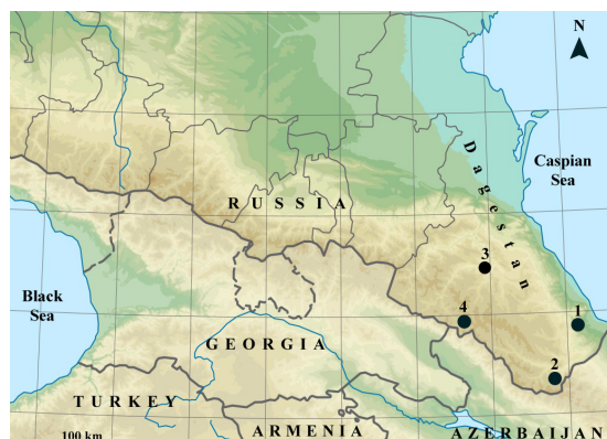
Fig. 1. Location of Dagestan in the Caucasus and of the sampling sites (1–4).

Lichens were collected by the authors in four localities situated in the foothills (loc. 1) and in the mountainous part of Dagestan (locs 2–4; Fig. 1). The 1 st locality is a dry steppe in a gully at about 100 m altitude with calcareous bedrock.